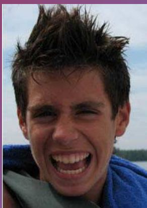
I can't wait to see it!