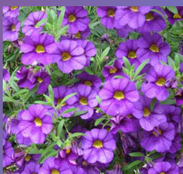
Flowers from outside the Stained Glass studio, Summer 2006

Keep your eyes open, it'll be here soon!