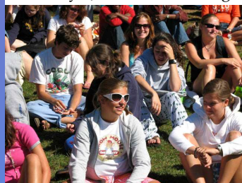
Another bright and sunny Med-O-Lark morning.

So in the months to come we invite you to join with us as we imagine together, at times in fun, and at times a bit more seriously. Join us as we imag-