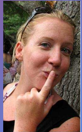
Guess what I heard...