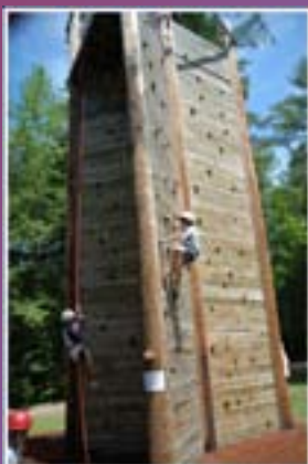
The Climbing Wall