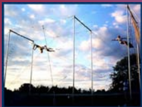
The Circus Trapeze

So as you all now know, Med-O-Lark is turning 40 next summer!!! Dedicated to bringing you new and exciting programs every summer, in honor of this major milestone in the camp's history, we have decided to implement a major new program in the summer of 2007. For the last two months we've been gathering input from campers, and we now have the top three choices compiled: The Circus Trapeze, The Climbing Wall, and The Rockin' Skate Park. So now, IT's TIME TO VOTE!!!