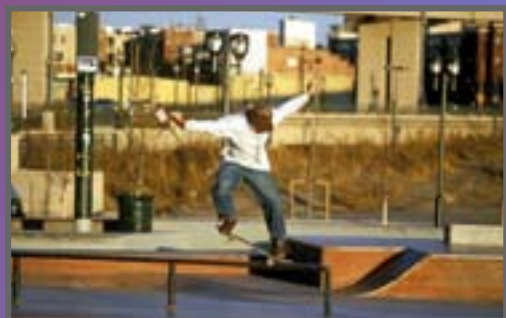
The Rockin' Skate Park