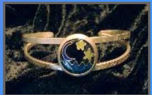
An example of an enameling-metal jewelry collaboration.

We also plan to have a coordinated enamel and metals activity this summer - continuing the great job that was done last year. Even if you'd had enamels before, there is a lot more to learn and a lot of fun to be had. So plan on taking enamels this summer and you'll WOW your friends with what you've created!