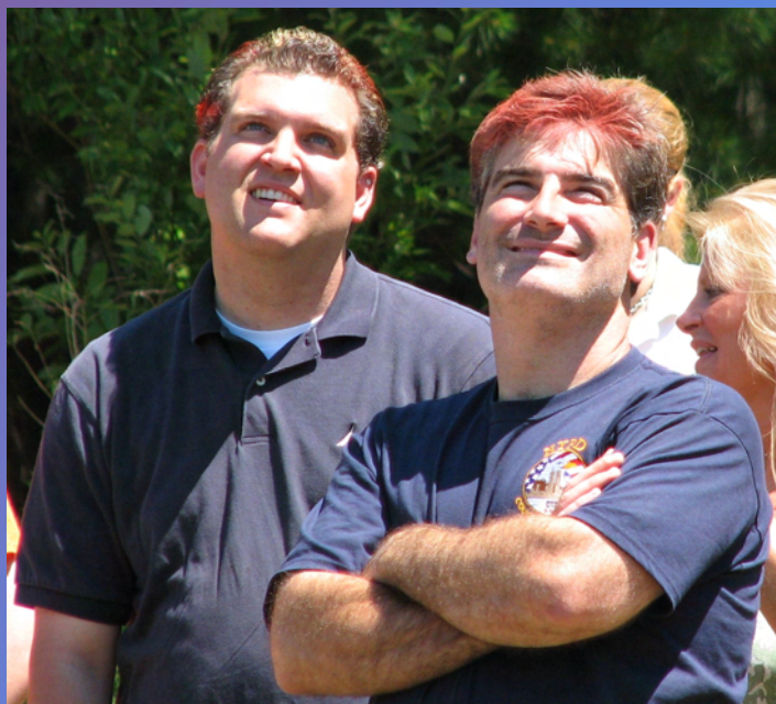
Dreaming of Next Summer Already...