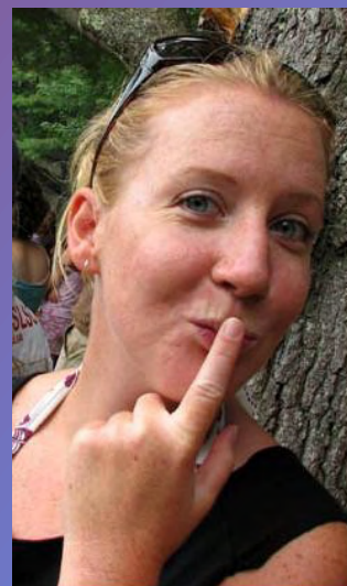
Guess what I heard...