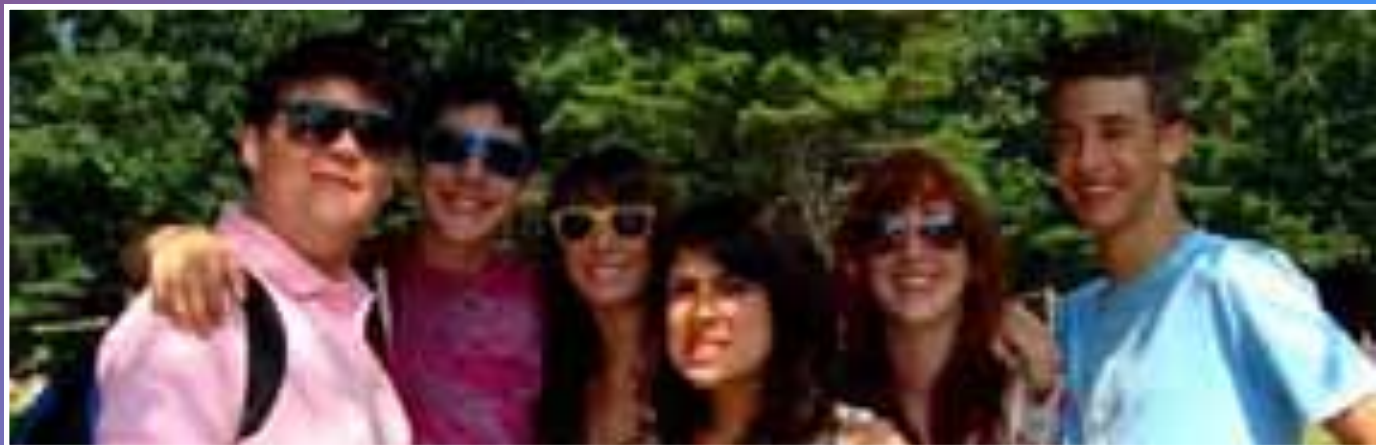
Everybody Together in 2008

And next month, keep your eyes peeled, because I have scrounged up yet another BLAST FROM THE PAST picture from the amazing Med-O-Lark Community! So be warned y'all, I'm digging through the archives and you never know what I may find!!!